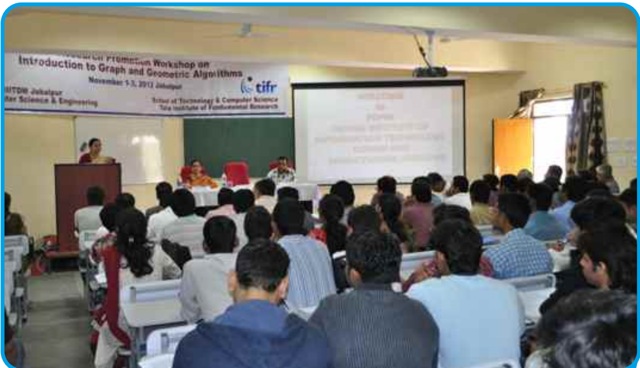
Workshop on Graph and Geometric Algorithms