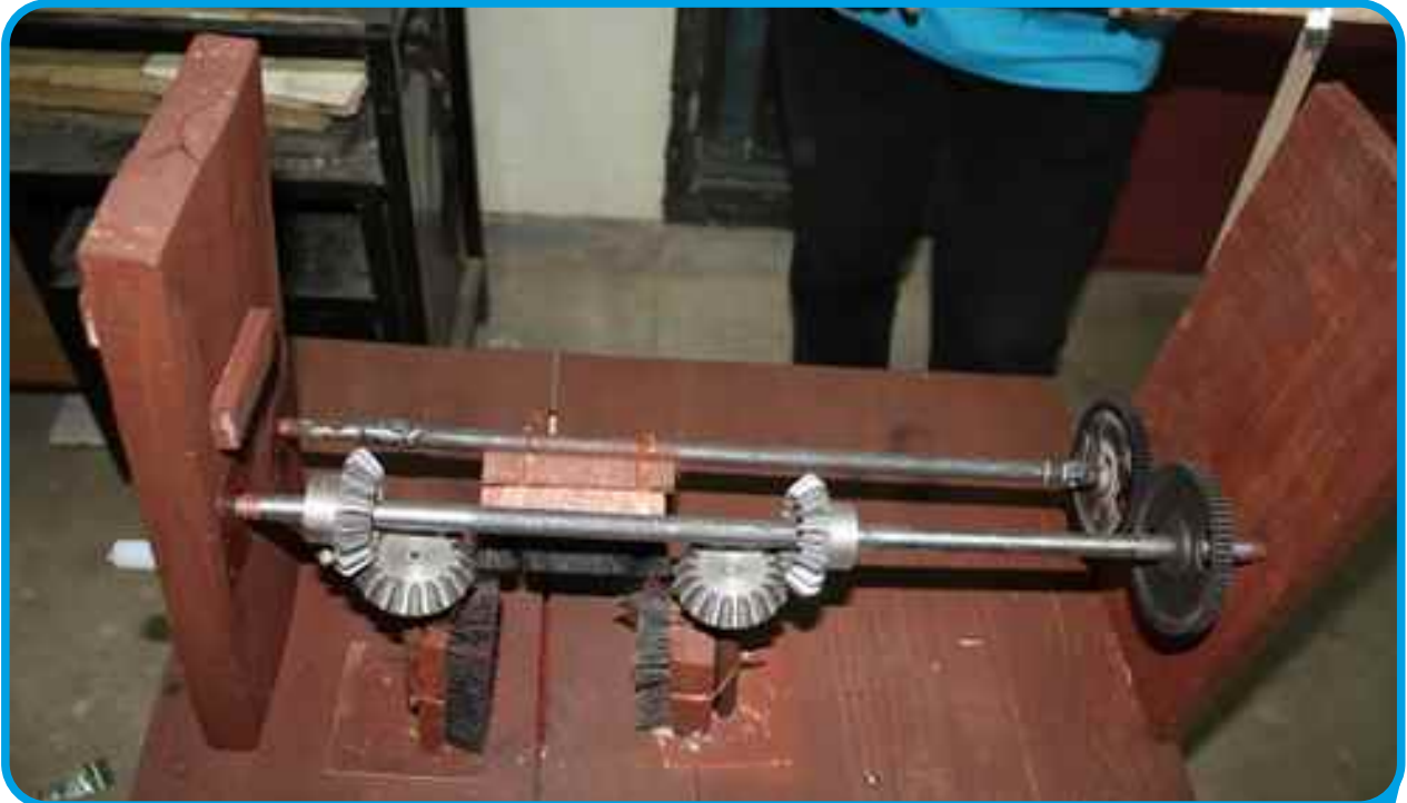
Automatic Shoe polishing Machine