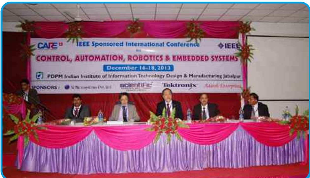
International Conference on Control, Automation, Robotics & Embedded Systems