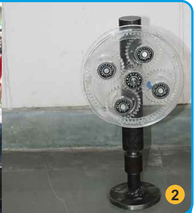
1. Fracture supporting device 2. Epicyclic gear